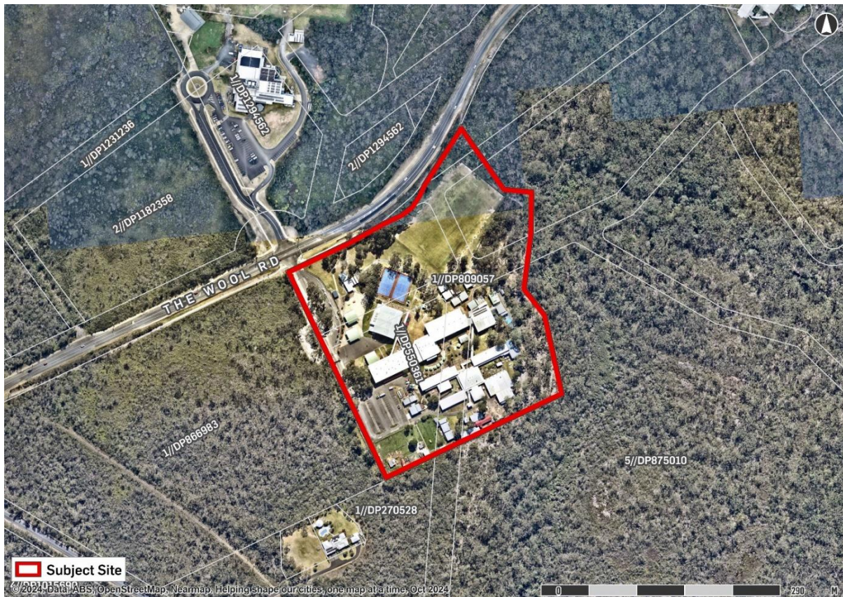
Figure 1 Aerial Photograph of the Site